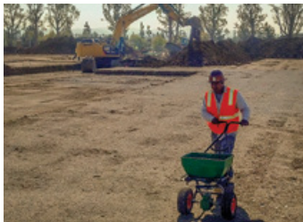
Can be mechanically or manually applied, no water needed.

Make your budget go at least 5x further. Contact us to find out how.